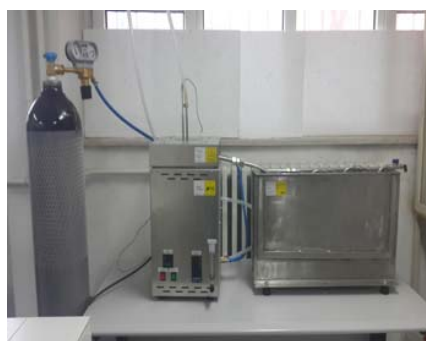
Fig. 1 Pyrolysis System

Waste HDPE and LDPE was crushed into approximately 8 mm pieces in plastic crusher. These waste plastics were pyrolysed at fixed bed reactor pyrolysis equipment. The crushed materials were pyrolysed at 700°C under a heating rate of 5°C/min in a chromium reactor (Fig. 1).