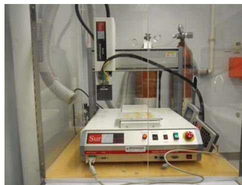
Fig. 1 Diagram of atmospheric pressure plasma system [4]

Plasma pre-treatment of cotton fabric was conducted by an atmospheric pressure plasma jet (APPJ), which can produce a stable discharge at atmospheric pressure with a radio frequency of 13.56 MHz. The plasma pre-treatment parameters of the cotton fabric were: (i) discharge power = 100 W and 130 W, 150 W; (ii) substrate speed = 10 mm/s; helium flow rate = 30 L/min.; oxygen flow rate = 0.3 L/min. and jet-to-substrate distance = 3 mm. Helium and oxygen were used as carrier and reactive gases, respectively. Figs. 1 and 2 show the diagram of the atmospheric pressure plasma system and the schematic diagram of atmospheric pressure plasma system used in this process, respectively.