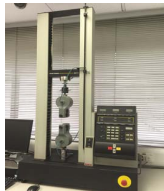
Fig. 4 Instron 4411