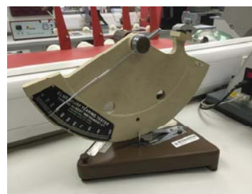
Fig. 5 Elmendorf tearing tester