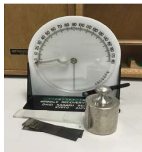
Fig. 3 Wrinkle recovery angle tester

In the tensile strength test (ASTM D5034 – 09), a 100 mm wide specimen was mounted centrally in clamps of the tensile testing machine (Instron 4411) and a force was applied until the specimen broke. Values for breaking force were obtained from the computer connected.