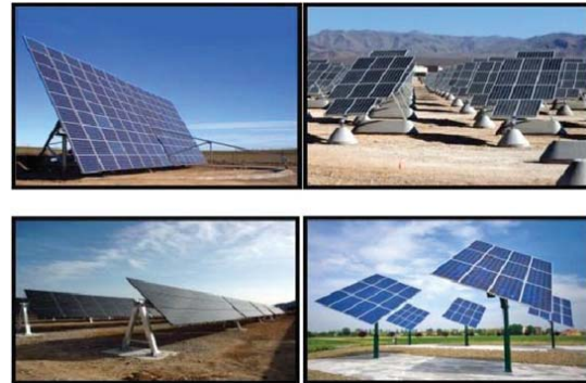
Fig. 1 Various Types of Solar Trackers