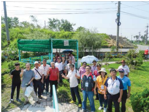
Fig. 13 More local residents were involved