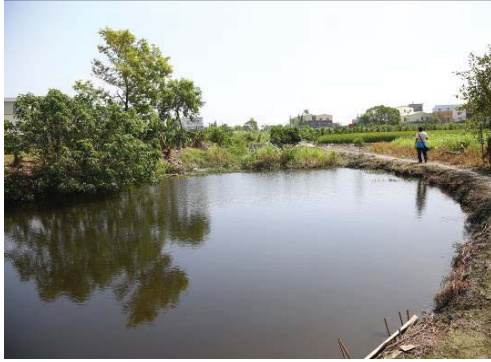
Fig. 5 Analysis landscape features