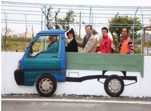
Fig. 12 Works with resident involvement were more creative