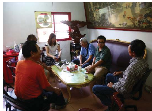
Fig. 3 Pre-tested interview-2