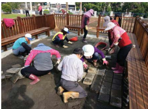
Fig. 8 Each participant Construction Participation-1