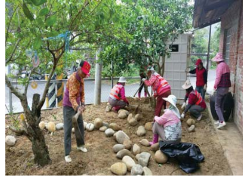
Fig. 9 Each participant Construction Participation-2