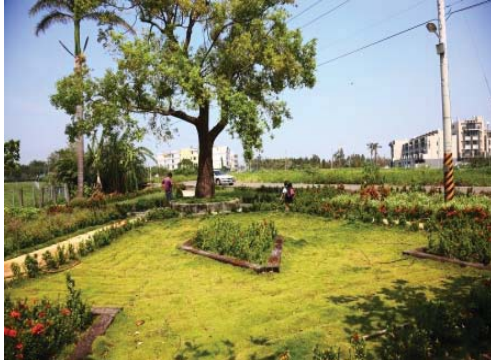
Fig. 11 Maintenance works were carried out better