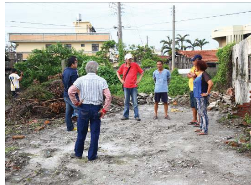
Fig. 2 Pre-tested interview-1