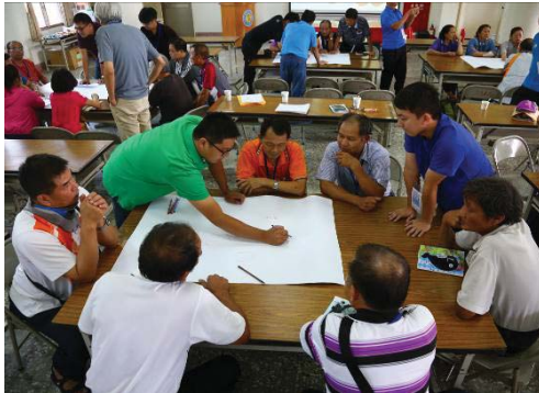
Fig. 6 Each participant had a concise version of the design