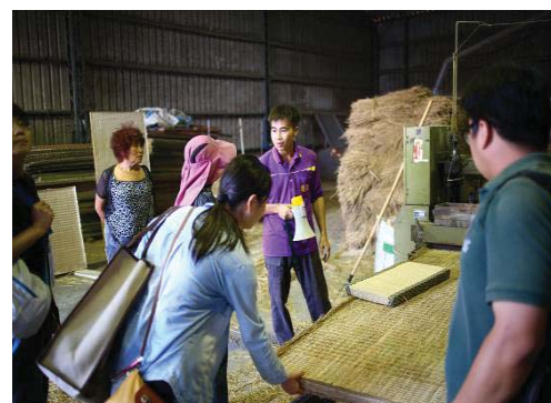
Fig. 4 Community characteristics

We also found that after conducting a series of participatory designed activities to encourage more in-depth and lively discussions, this allowed participants to more clearly articulate when voicing their preferences for landscape conditions, and be generally more meaningful when communicating landscaping issues.