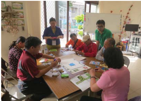
Fig. 7 Conducting a series of participatory designed activities