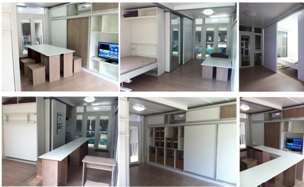
Fig. 3 Function change of the interior space

There were unique design concepts in space distribution and interior function layout. People's need for space is always variable, which means in order to cope with the problem different spaces should exist in different times. Static design meant the wastage of space by preparing all the space at one time. For the sustainable reason, dynamic concept can be used to solve the contradiction by changing all the furniture. For example, by allowing all the furniture to be folded inside the wall, different functions can be converted within a few seconds. It could provide accommodation for 6 people at night or allow 20 people to have a party (Fig. 3).