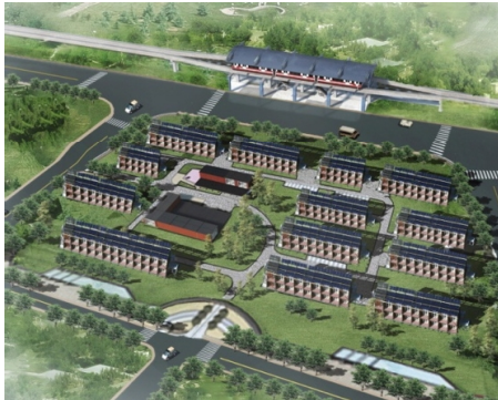
Fig. 1 Temporary residential zone near metro

The designated disassembly time was 50 years, so all the aspects of component intensity and connecting construction must be focused on multiple repeat construction. That required the consideration of convince of reassembly, joint duration, and reserved interface operation in the design stage [7].