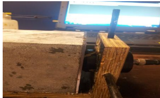
Fig. 2 Testing the concrete specimen with solid coupling