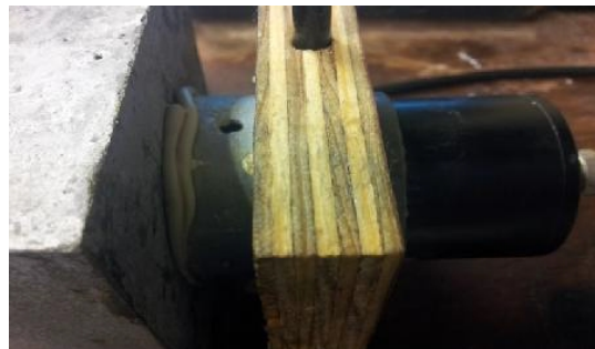
Fig. 3 Testing the concrete specimen with liquid coupling

The highest speed of sound was measured using the couplant with closest match of acoustic impedance with concrete (carbon fibre). All other couplants had lower acoustic impedance than the concrete. As a matter of fact, the amount of energy transmitted through an interface depends on acoustic impedances of the two media. If the two media have close impedance values, more energy will be transmitted. As the solid materials have acoustic impedance higher than those of liquids compared to concrete's impedance, thus it is thought that the more energy will be transmitted through the interface solid-concrete. There seems to be relationship between the speed of sound measured and the difference between the acoustic impedance of the couplant and the concrete. The steel transducer (i.e. non coupled system) has a very high acoustic impedance ( >40 ), but it not clear why this should give a lower speed of sound than the carbon fibre yet a higher speed of