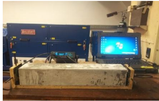
Fig. 1 Ultrasonic pulse velocity test instrument with concrete specimen in position

Based on the preliminary results, it can be noted that the uncoupled and coupled systems are returning different values for the pulse velocity of the concrete. It is clear that the measured speed of sound depends on the couplant used. Concrete is a multiphase material, where the speed of sound in aggregate is generally higher than that through cement paste, and the two phases will have slightly different acoustic impedance. It is thus reasonable to assume that the differences are due to preferential coupling effects.