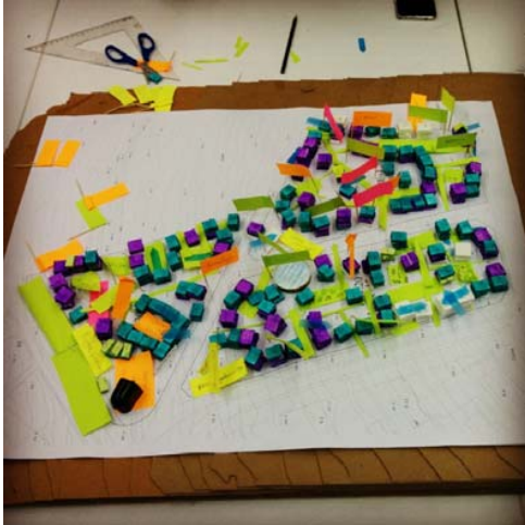
Fig. 11 Users are playing the game named "simulasyon" [36]

The design team said that taking the users' opinions into consideration made them happy and made the game very efficient. Moreover, 10 different site plans initiating from residents' ideas (Fig. 12) have been converted into three dimensional models and the resulting models have been analyzed. In the next phase, with the help of the analysis obtained from the game, real alternative designs have been prepared in the direction of users' desires [36].