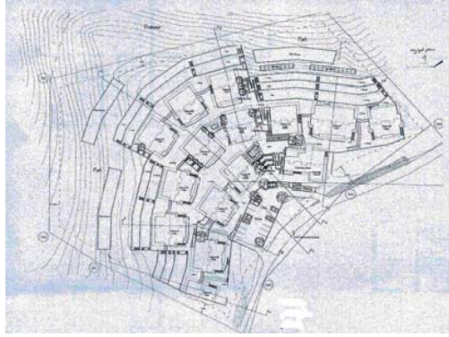
Fig. 9 Site Plan of Beriköy [34]