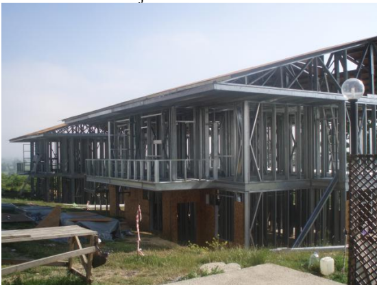
Fig. 7 Steel structure of Beriköy [33]