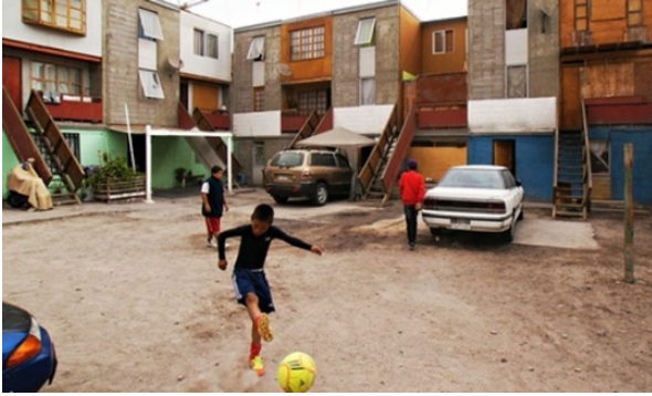
Fig. 6 Quinta Monroy after the users' intervention [31]

Elemental's approach allows the users to shape their home depending on their needs and budgets over time. By doing so, it has become one of the examples in which the architecture can be a solution to the problem of poverty and lack of dwelling. By creating these advantages, Quinta Monroy has become a role model to the upcoming projects [32].