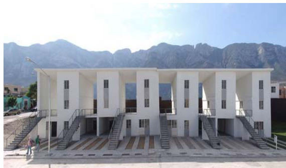
Fig. 5 Quinta Monroy before the users' intervention [31]

In this new solution, instead of a thirty square meter small house, a seventy two square meter big house whose half has been finished is built. The parts which are hard to construct such as kitchen, bathroom, and stairs are constructed by the government and the remaining parts of the house will be constructed by the users according to their needs and budget in progress of time. With this approach which increases the satisfaction ratio of users, the project has been finished in a short period time.