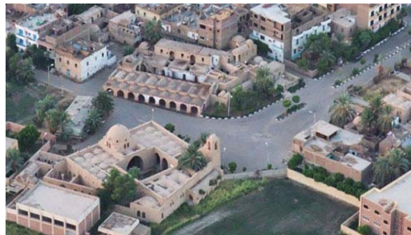
Fig. 1 Contemporary aerial photo of New Gourni [24]

that the name of the book has been changed to "Construction together with the public" in the French translations is a good indication that the mission of Hassan Fathy has been understood better through time [27].