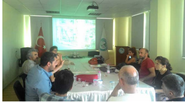
Fig. 13 Giving information about the project to local government [36]

The members of the cooperative and some volunteers have given information about the details of the project to the local government and they have had an exchange of ideas (Fig. 13). After the technical drawings have been completed, the license to start the building process has been acquired. It is aimed that user participation will be achieved also in the building process [36].