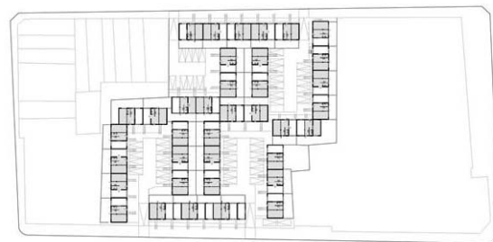
Fig. 4 Site plan of Quinta Monroy [31]

In this new solution, instead of a thirty square meter small house, a seventy two square meter big house whose half has been finished is built. The parts which are hard to construct such as kitchen, bathroom, and stairs are constructed by the government and the remaining parts of the house will be constructed by the users according to their needs and budget in progress of time. With this approach which increases the satisfaction ratio of users, the project has been finished in a short period time.