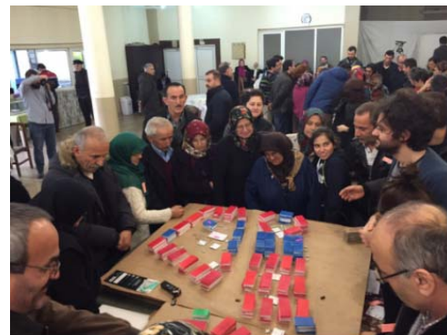
Fig. 10 Users are playing the game named "simulasyon"[36]

In order to achieve the user participation, a game called "Simülasyon" (Simulation) has been designed. The aim of the game is to take the users' opinion about the environment and their dwelling into consideration in order to create the site plan and built concept. (Figs. 10, 11)