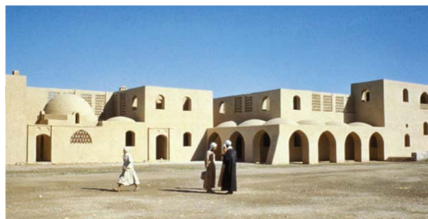
Fig. 2 Street in New Gourni in the 50 s [24]