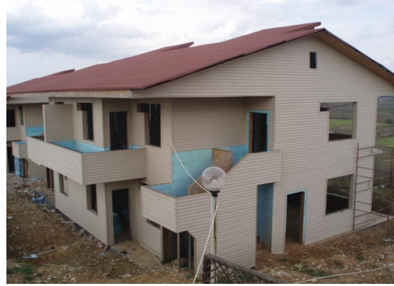
Fig. 8 Photo of the unit during the construction [33]

Beriköy is a project that which has been started by eleven architecture and engineering students in September, 1999 and, as Jan Wampler says, reflects a progressive approach. The group has worked for three months in order to determine the concept of the settlement and the first design ideas. In January, 2000 the projects have been brought to Turkey and opinions of some academicians from Istanbul Technical University and various professionals have been 50 dwellings were planned; each dwelling living 60-90 square meters in two stories. Dwellings were coming together as a group of two or four units. In dwellings, balcony, sun roof and other facade options have been left to the users' preferences [34].