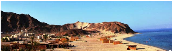
Fig. 6 Basata Resort [28]

Basata is the first unique eco-lodge built in Egypt in 1986. The resort is located in South Sinai between Taba and Nuweiba, possessing one of the best five beaches in the world. Basata means “simplicity” in Arabic, which personifies the philosophy behind this environmentally conscious tourist project.