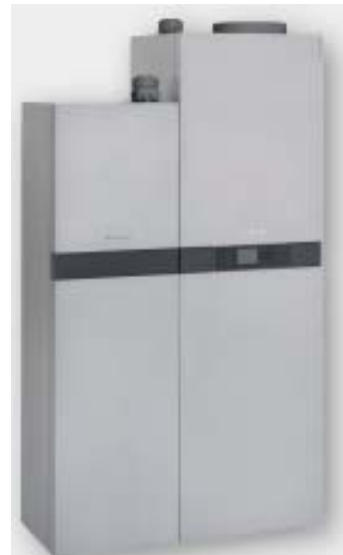
Fig. 3 Vitovalor 300-P is 0.75 kW CHP System

Vitovalor 300-P is 0.75 kW PEMFC based fuel cell CHP system which is integrated with integral gas condensing boiler for peak load as shown in Fig. 3. Cost of installation of this system is reported as £22000. Average expected return on this investment is £1000/annum [8]. Electrical efficiency of the fuel cell module is reported as 37% and overall efficiency is 90%. It delivers a maximum of 19 kW of heat output and produces 15 kWh of daily electricity. Internal boiler will start automatically when the heat demand goes above the heat produced by the fuel cell i.e. in the peak time. Vitovalor 300-P also comes with an App (mobile application) to remotely control the CHP operations including to change room temperature, control program timers, start and stop, etc. [8]