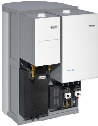
Fig. 4 Elcore 2400 0.3 kW CHP System