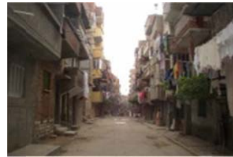
Fig. 3 Passages

Nevertheless, the layout of multifunctional vertices at the various graph levels is more integrated than the other of functional merge only at the deep 'inhabitant' domain. The isomorphic graphs of layouts '4 & 1' enforce the same observation with the less layout integrity of single function per room. However, the graphs of layouts '3 & 20' have a fewer number of deep vertices with a higher spatial integrity. Thus, the deepest graph level of more vertices with single functions causes the less integration of layout. Another phenomenon observes the more layout integration of direct access between the 'visitor' and 'inhabitant' domains, while the insertion of access corridor between them causes the decrease of spatial integrity. Meanwhile, the first two layouts of integral range split their utility rooms apart from each other, while the further three layouts set the 'toilet' inside the 'kitchen' depth.