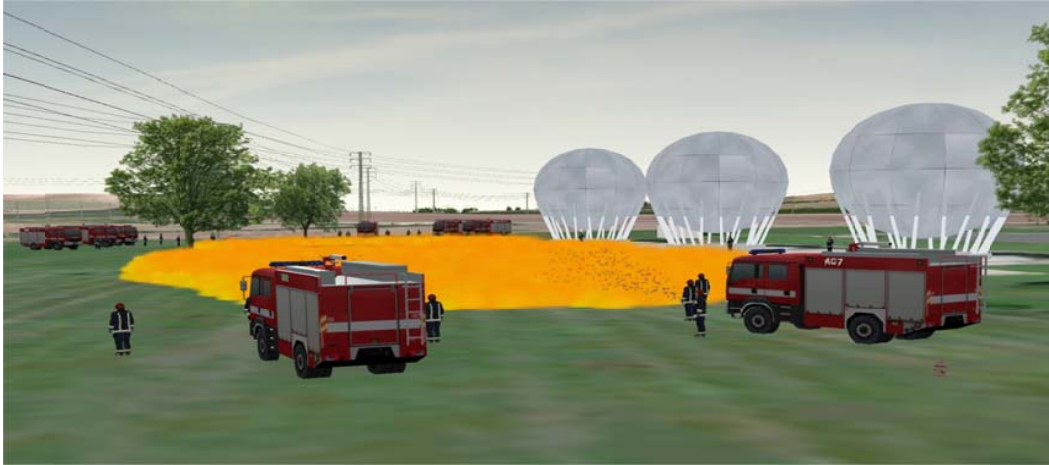
Fig. 4 Overview the Interface of Simulator WASP

Environment in the simulator is ensured by the combination of terrain database created from the detailed geographical data, model of weather and other dynamic environmental models. Terrain database contains all common objects in the countryside (bodies of water, roads, built-up areas, vegetation, relief, type of soil and other objects). Individual objects have predefined features influencing simulation of their own entities in relation to their purpose. Weather editor enables to set basic parameters (date and time, air temperature, velocity and direction of the wind, type and intensity of precipitations, humidity and pressure of air, type of cloud cover, light intensity etc.) [18]. Some of the parameters are mutually interlinked based on the actions happening in the atmosphere known from meteorology. Dynamic models of environment enable to modification the countryside with objects and phenomena which can change their form in the course of time. There are accidents simulated in great detail as well as a vast