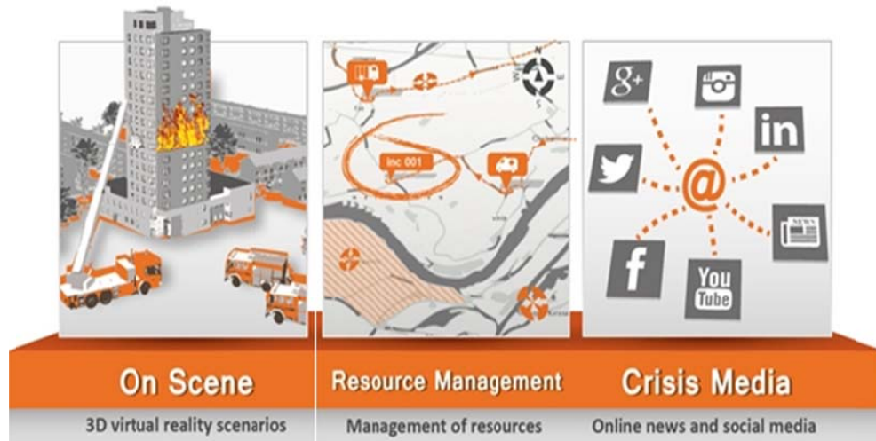
Fig. 2 XVR Platform

The application Virtual Reality training software for safety and security (XVR) consists of several programs. They are: XVR Crisis Media, XVR Resource Management, XVR On Scene and XVR Toolkit (Fig. 1). These programs serve to the resolvers of emergency or crisis situations in preparation and practicing practical abilities [16].