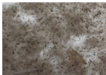
Fig. 3 Optical image of vermiculite-fortified cellulose mat

Since vermiculite is a clay it could be easily incorporated to paper pulp to prepare mats. The experimental mats incorporated ~11 wt% clay fillers saturated with either Cu nanoparticles or ionic Cu and then allowed to dry. Fig. 3 shows the image of zoomed section of one of the mats used in this study. Dark specs represent vermiculite particles embedded in the structure of cellulose fibers.