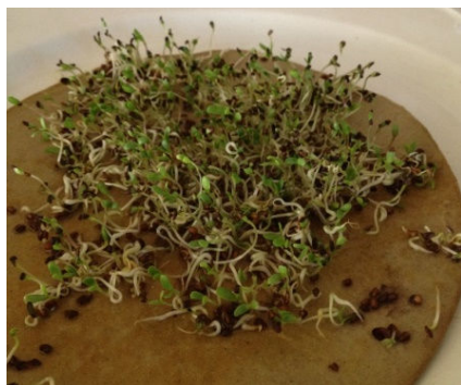
Fig. 4 Sprouts that grew on mineral-fortified cellulose mat

of copper. Fig. 4 shows example of alfalfa sprouts germinated on one of the mats.