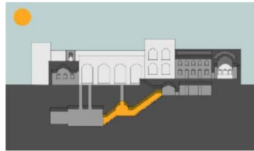
Fig. 2 Stairs to Shovadan and Shabestan (an underground space)

that are connected to Shovadan on the left and to Shabestan on the right of the picture.