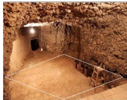
Fig. 3 Shovadan Hall

Sometimes in large Shovadans there is a difference in the depth of Sahn with other spaces and caused Sahn to be recognized easily from other spaces [1], [2], [4]. Fig. 3 shows a Sahn in a Shovadan. White line shows the districts of Sahn.