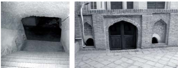
Fig. 1 Entrance of Shovadan