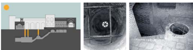
Fig. 6 Darize (a cylindrical vertical duct)

In Shovadan, the temperature of Kats and wide stairs, that have less depth than Sahn, is more than the temperature of Sahn [2]. The underground connection between neighboring Shovadans and having access to the riverside through the underground way for avoiding the intense solar radiation during summer days and for defense against enemies caused the formation of an underground life in Dezfoul city. During the hot days of summer social connections were made in Shovadans.