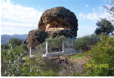
Fig. 6 Safeguarding of rock art site