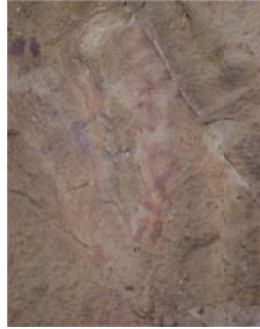
(b) Ahmil site (Yakouren)