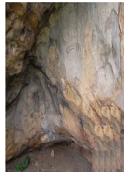
Fig. 5 Use of cave as shelter, Tifra site (Tigzirt sur mer)

The caves misused by shepherds as shelter which may cause their deteriorations. (Fig. 5)