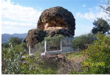
Fig. 6 Safeguarding of rock art site