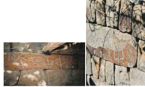
Fig. 4 Masterpieces used in construction

Houses were and continue to be constructed using tiles with masterpieces of our ancestors (Fig. 4).