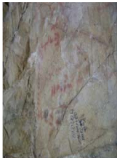
(a) Ifigha site

The nonexistence of keepers, facilitates the degradation and destruction of these sites. Thus, sites that have stood for thousands of years to the vagaries of nature can disappear in less than a decade.