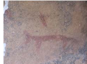
(e) Tarihant site (Azrou Imayazen)