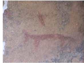
(e) Tarihant site (Azrou Imayazen)