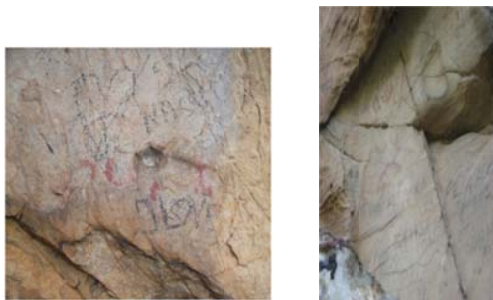
(b) Tifra site (Tigzirt sur mer) (c) Ait Ighil site (Yakouren)