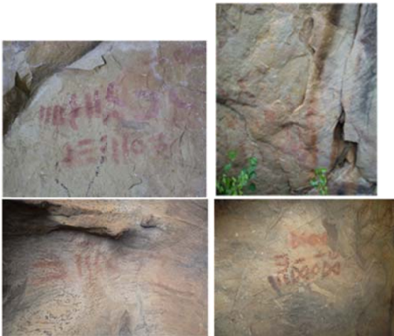
(b) Tifra site (Tigzirt sur mer)