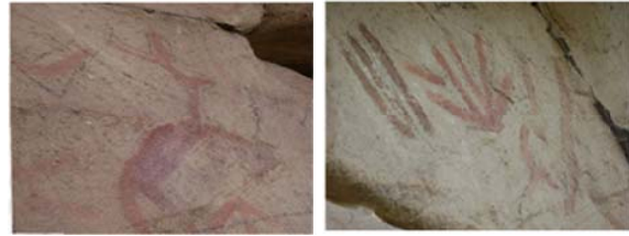
(d) Ait Ighil site (Yakouren)