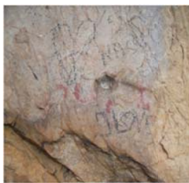
(b) Tifra site (Tigzirt sur mer)