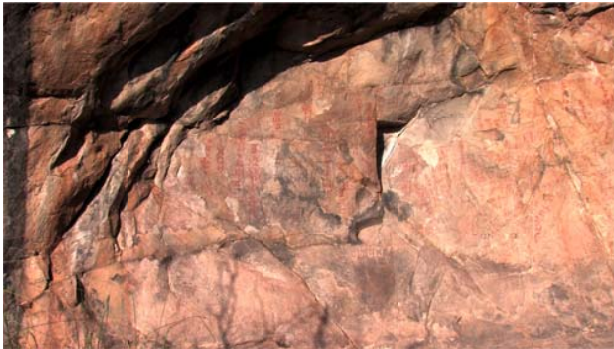
(a) Ifigha site

These sites' attendance is very low in Kabylia and concerns only some researchers and students and some tourists, it is mainly due to the eccentric location and difficult access of these sites. On the other side, the integration of this heritage in the daily life of the local population is very poor or inexistent.