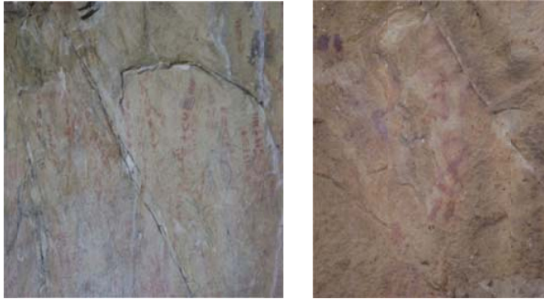
(a) Ifigha site (b) Ahmil site (Yakouren)