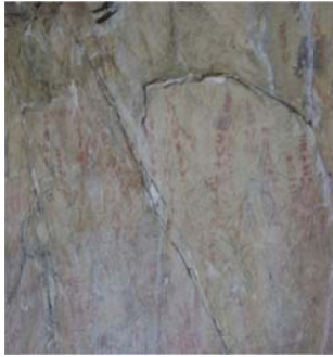
(a) Ifigha site