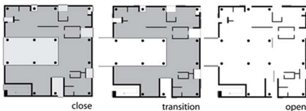
Fig. 2 Network of central and peripheral courtyards

The ultimate malleability and flexibility of the house allows the user to constantly alter the spatial conditions, merging himself into unison not only with the built part of the dwelling, but with the equally constituent element of nature and weather.