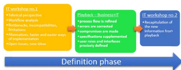
Fig. 1 Steps in the BPM definition phase

Beside the one playback, two workshops were held internally in the IT department (Fig. 1). This prevented larger misconceptions, misdirection's and failures in the beginning of the project. First workshop was after the initial overview of the user specifications and before the first playback, and the second one after the playback. The purpose of that workshop was to carefully analyze potential flaws in the overall process workflow, defined by the business sector, from a technical perspective. Possible bottlenecks and incompatibilities with existing applications are identified, some alternatives to ease and speed up the implementation are suggested, and possible technical limitations noted. Undefined cases, and any open questions are listed, and new ideas considered. Based on the conclusions and initial business specification a basic data model was developed, specific authorization and user roles sketched to demonstrate control, basic forms constructed to show the visual imprint. With the described preparations in place, the first playback was held. Together with the business users the process flow is refined, errors corrected, compromises made, specifications supplemented, user roles and interfaces precisely defined.