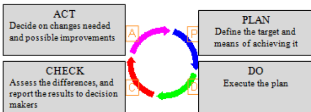
Fig. 1 Principle of the Deming Wheel

Reference [21] modified the Shewhart cycle in 1993 and called it the Shewhart cycle for learning and improvement, PDSA (Plan-Do-Study-Act) cycle. He described it as a flowchart for learning and improving a product or process. This modification was consolidated by researchers [22] to form the basis of the improvement model.