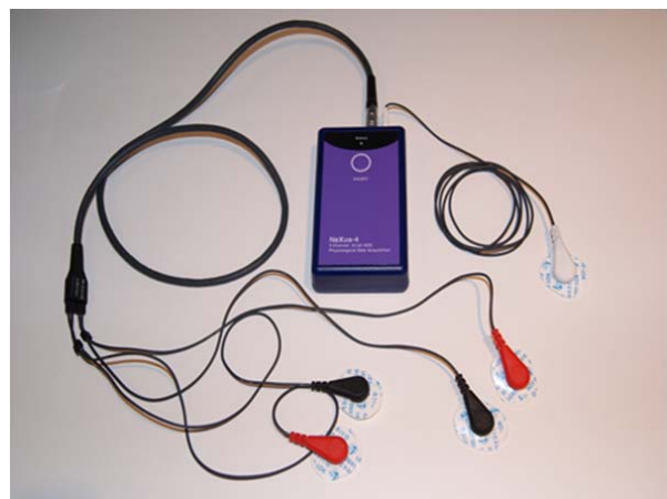
Fig. 3 Electromyograph with surface-placed electrodes

If there was no yawning response, then a second saliva sample was taken at the end of the experimental paradigm. A yawning susceptibility scale, designed in a previous study [3], Hospital Anxiety and Depression Scale (HADS) [21], [22], General Health Questionnaire GHQ28 [23]-[26], and demographic and health details were also collected from each participant.