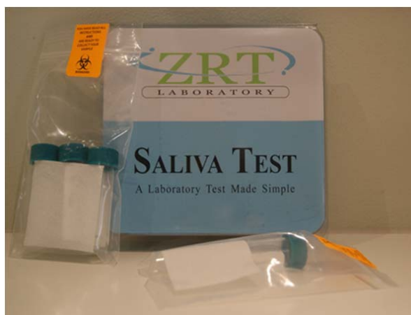
Fig. 2 Saliva cortisol test kit

Saliva samples were collected at start and again after yawning response (Fig. 2), together with electromyography data of the jaw muscles to determine rest and yawning phases of neural activity (Fig. 3).