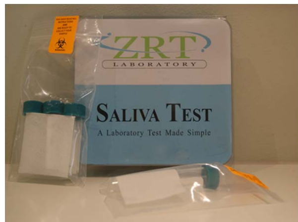
Fig. 2 Saliva cortisol test kit

Saliva samples were collected at start and again after yawning response (Fig. 2), together with electromyography data of the jaw muscles to determine rest and yawning phases of neural activity (Fig. 3).