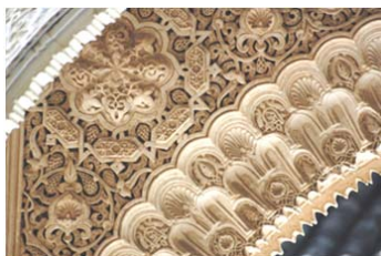
Fig. 7 The use of arabesque patterns in Alhambra Palaces [4]

Floral patterns can be seen in arabesque designs which are formed by an abstraction of the earlier leaf-scroll motifs [1]. This vegetal ornament is characterized by a continuous abstractive stem which splits repeatedly to produce a series of curving counterpoised vegetal patterns flowing in all directions. The sense of periodicity and the rhythm is very noticeable in these patterns (Fig. 7).