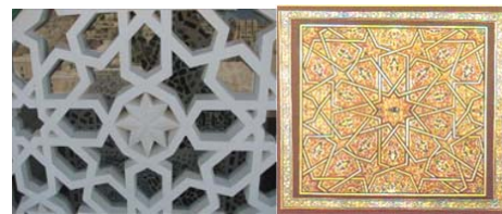
Fig. 4 The star shapes decorate most of the Islamic building 'the Dom of the Rock' [11]