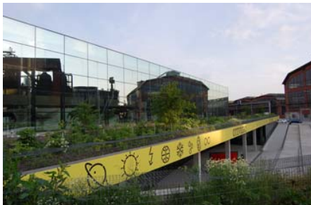
Fig. 4 Mirror glazing

Facade carried out in this way has significantly more plastic character compared to the compress. Individually baked bricks have variable coloring and joints are much deeper, the facade then doesn't caused compact impression.