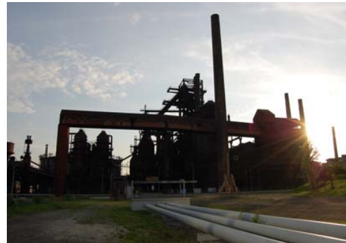
Fig. 1 Vítkovice area

Vítkovice area for the possibility of drawing funds from ministry of culture Integrated Operating Programme and also therefore in the same year there was made a nonprofit organization called Association of Lower Vítkovice area legal entities.