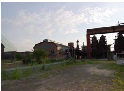
Fig. 7 U6 – Small World Technology

Energy panel is used to manufacture compressed air using two piston blowers weighing together nine hundred tons, which even today are made interesting internal spaces of the building energy exchange. These "lungs smelter" were built in 1938 and in 2012 was converted into a museum called Small World techniques attracting visitors on an interactive tour of the history of technology. Children as well as adults here can try what it is to land a plane or drive a car, pedaling on a stationary bike can warm up the radio and to experience firsthand the production of electricity, they can look at the actual models of production facilities and there waits for them many other activities. The first floor was built viewing terrace from which you can see the entire exhibition together with blowers from above. The tour then continues after technical stairs to the catacombs, where they are installed technical attraction with water and steam. The ground floor of the building can be found, inter alia, refreshments, changing rooms, classrooms and a hall for educational lectures for students and teachers who are here to gain experience of new forms of teaching work undertaken through games, animations and so on. For conversion of energy exchanges stands architectural Studio Z - Helena and Václav Zemánek and architect Zdenek Franek, who participated in the final revised project.