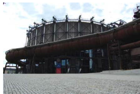
Fig. 6 Gasometer Gong

Gasholder has become a convention center, which seats up to 1500 seats, gallery, restaurant, lounge and locker rooms. In order to achieve this final form, it was necessary to use special construction technology. After the production of the gas tank is empty, the bell remained at a height of one and a half meters inside the entrance featured a hole burned in the mantle of size two times three meters.