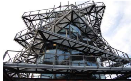
Fig. 5 Extension of the blast furnace

bridge was installed four-ton skip hoist with authentic propulsion engine. The car is in the top glass clear glass and the bottom glass black and is able to take up to sixteen persons. The tower is sixty meters high, allows a unique view of the Lower Vítkovice, and the panorama of Ostrava.