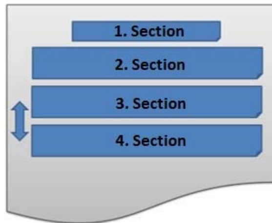
Fig. 2 Abstract pattern of a text's discourse structure with both fixed and variable sections

exist. An output condition can, i.e. allow for the existence or the height of one or more values in the input data.