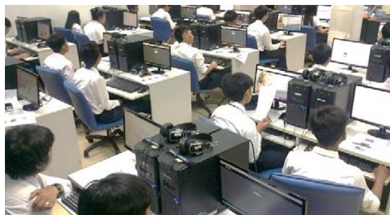
Fig. 3 Thai Students participation on the training program

The Speexx ILPC-SSRU website includes as follows: (a) Study the course description for Business English Communication (b) define the objectives and (c) construct the lessons-containing vocabulary, expressions, structures, exercises, tests and questionnaires and also adding other activities. The website is provided at http://www.speexx.ssrु.ac.th/index which shows the homepage, interactive program, and video tutorial on how the program is used. This is shown in Figs. 1-4.