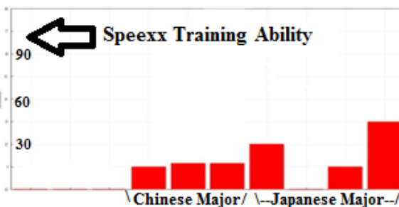
Fig. 4 Thai student ability results on Speexx Training Program