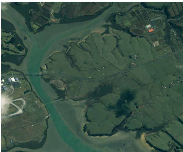
Fig. 3 Original geospatial image (Image is taken from Sample Imagery List of GeoEye Inc. (formerly Orbital Imaging Corporation or ORBIMAGE) which is an American commercial satellite imagery company)

From Table III, it is clear that pixel level parallelism is more efficient than its sequential counterpart. Image is taken from Sample Imagery List of GeoEye Inc. (formerly Orbital Imaging Corporation or ORBIMAGE) which is an American commercial satellite imagery company. The original image is depicted in Fig. 3. The edge detected image is depicted in Fig. 4.