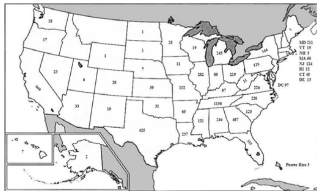
Fig. 1 Distribution of Medical and Dental Graduates in 1950-2013

Secondary data were extracted from Meharry Medical College's alumni tracking system which contained practicing specialties and locations from 1950 to 2013. All datasets were de-identified before being obtained for the study to protect the privacy of the graduates. A sample of 3,864 college graduates (2,464 medical and 1,400 dental) in years 1975 – 2013 was selected from a total of 6,896 college graduates (4,682 medical and 2,214 dental) in years 1950 – 2013 (See Fig. 1).