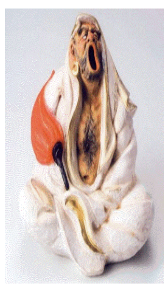
Fig. 5 Japanese sculpture depicting yawning