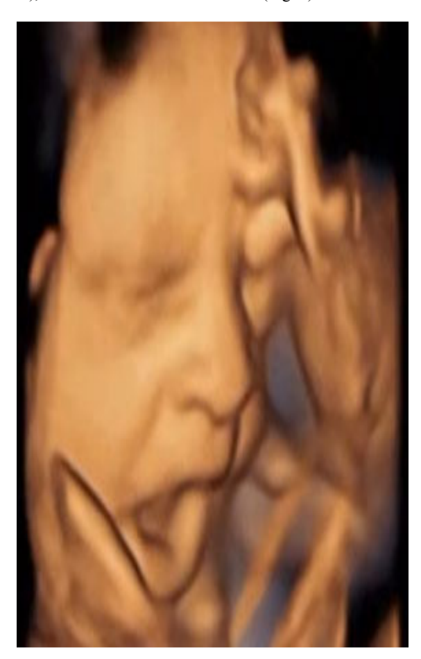
Fig. 4 Yawning in the foetus [18]

Yawning has been observed in the foetus (Fig. 4), and has been depicted for centuries in Japanese sculpture (Fig. 5); and even the famous Chiricahua Apache Chief of South East Arizona, United States, and Medical Man, Geronimo (1829 – 1909), was named "One Who Yawns" (Fig. 6).