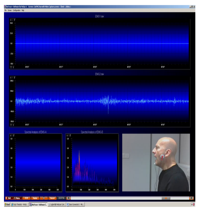
Fig. 3 EMG recording of the yawn reflex

Saliva samples were collected at the start and again after the yawning response, together with electromyography (EMG) data of the jaw muscles (using non-invasive surface-placed electrodes) to determine rest and yawning phases of neural activity (Fig. 3).