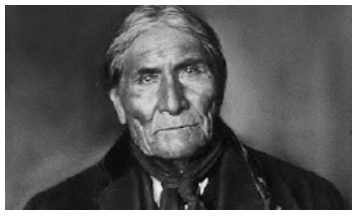
Fig. 6 Geronimo

It is hoped that further research into brain temperature, cortisol and yawning, particularly with MS patients, may provide us with a far better understanding of our natural physical coping strategies, the origin of the yawning mechanism, and about how we cope with stress and fatigue.