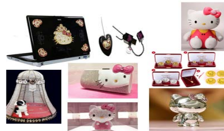
Fig. 5 Expensive Kitty

If you live in Japan, you can easily collect Kitty's goods just as you frequent a McDonald, or Kentucky Fried Chicken fast food restaurant, you can find Kitty's items such as dolls, stickers, plates, lunch boxes in collaboration with other companies. Kitty's shows and movies have produced and shown. Kitty also remade the world great fairy tales such as Thumbelina, Cinderella, White Snow, Hansel and Gretel, and etc. In addition, board and card games and Nintendo DS electronic games featuring the Kitty character were also created.