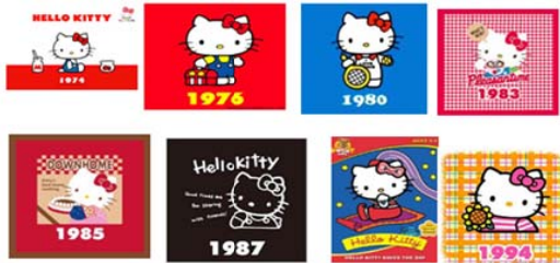
Fig. 2 Kitty's Change from 1974 to 1994