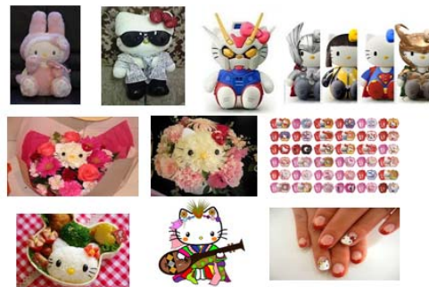
Fig. 7 Variation of Kitty