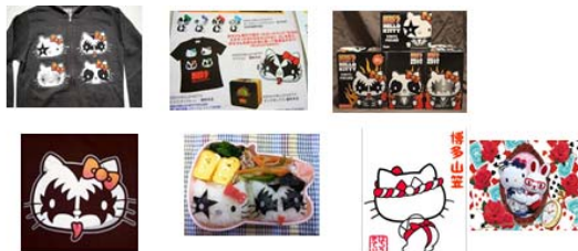
Fig. 8 Kitty's Controversy