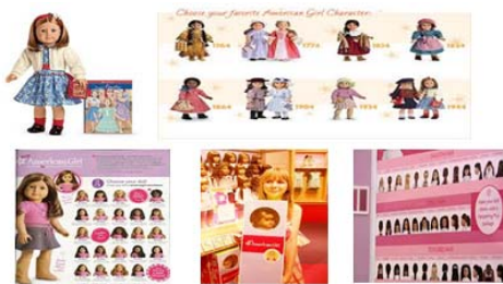
Fig. 6 American Girl

In the below, Kitty and American Girl are compared to see commonality and differences.