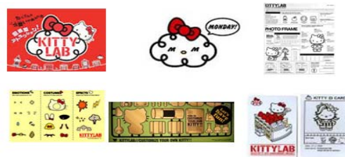
Fig. 9 KITTY LAB

It is unique that consumers can choose and change product's facial expression with their own choice because usually because of trademarks, character's shapes or faces are restricted as we can see Snoopy by Charles Schultz. Kitty's choice of its face gives consumers flexibility and enjoyment to create their own Kitty. In this way, we can interpret consumers realize their own autonomy by selection of products, which can lead their representation of identity.