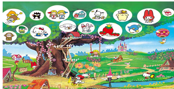
Fig. 1 Sanrio’s Characters

Now we see Kitty’s history and its popularity through the eyes of a Kitty fan, and “Kittyler.” Kitty is popular to many Kittylers because Kitty and its numerous products are affordable, and its simple designs are captivating to many people. Kitty has been popular since its creation by Sanrio Co., Ltd. Although Sanrio has created many fantastic characters including Little Twin Stars (Kiki & Lala), Patty and Jimmy (a couple of a girl and a boy), Bad Batsumaru (bad penguin), Usahana (a rabbit), Osaru no Monkichi (a monkey), etc. [3], Kitty has been most popular among them. However, Kitty has been changed periodically to maintain its consumer appeal.