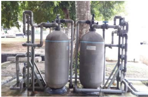
Fig. 2 The Water-Filter Tank installed outside the Canteen of Nilai University (inside the campus)

The objectives of the research reported in the paper are as follows: (a) to determine whether or not the water filter tank is a thin-walled or a thick-walled cylinder; (b) to compute longitudinal stresses for the working pressure and the maximum working pressure; (c) to compute hoop stresses for the working pressure and the maximum working pressure; and (d) to critically study the factor of safety (FoS) in design of the filter tank.