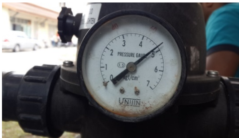
II. FIG. 3 WORKING PRESSURE READING ON THE PRESSURE GAGE EXPERIMENTAL WORK

The water filter tank installed in Nilai University Canteen was found to be made from fiberglass material (see Fig. 2). The thickness of the water filter was found out to be 40 mm.