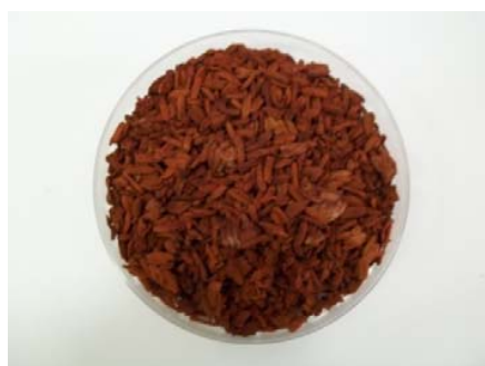
AN without histidine