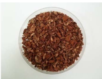
AN - AL without histidine