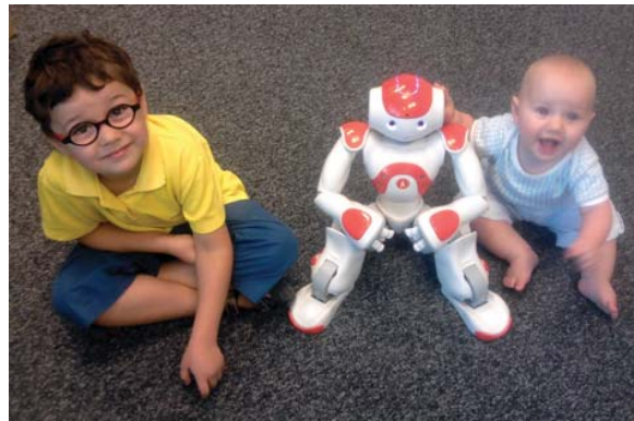
Fig. 1. Aldebaran NAO H25.