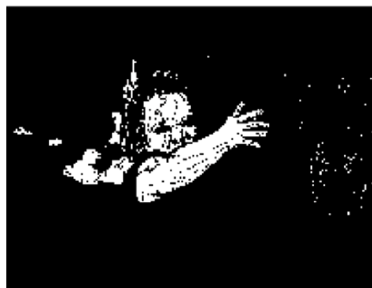
(b) False regions reduced using GLCM

Fig. 5 shows the final image result on the sharpening skin image after texture application.