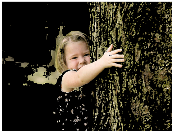
(a) Image with false skin regions