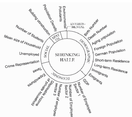
Fig. 2 The concept structure of variables of shrinking Halle

In summary, we initially established a comprehensive evaluation variable system of Halle's shrinkage (Fig. 2).