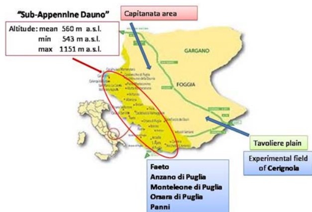
Fig. 1 Map of the Capitanata province

been grown in small plots, as they are mainly intended for family consumption [13].