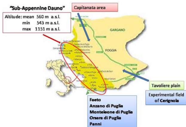
Fig. 1 Map of the Capitanata province

been grown in small plots, as they are mainly intended for family consumption [13].