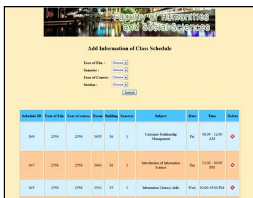
Fig. 2 Timetable Management System Details of the timetable by selecting the data to match with user requirements

The development of the online class scheduling management system by Webbased Application develops program using PHP language and database system using MySQL in the working process of the application of this system can provide several instructors to schedule simultaneously. Therefore, instructors can manage timetable by themselves, and check their timetable with searching and students can check and also publish a timetable and download other documents associated with the system immediately online. To fix the timetable, it is complicated and must be considered several factors depending on conditions and the number of courses. This also depends on the physical characteristics of each class. It will be much easier to change from manual to online one. New technology allows all users to save more time and ease their lives.