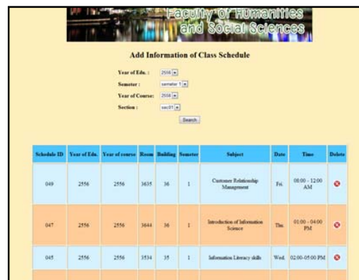
Fig. 3 Timetable Management System Details of the Timetable by Selecting the Data to Match with User Requirements