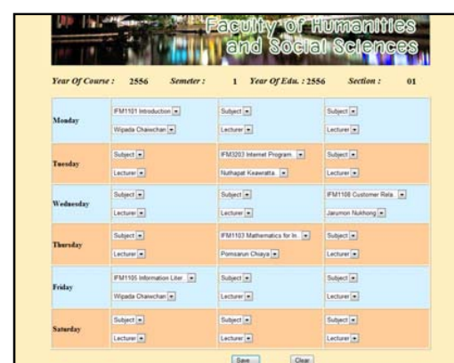
Fig. 4 Timetable management system Users are instructor can set and manage timetable by themselves