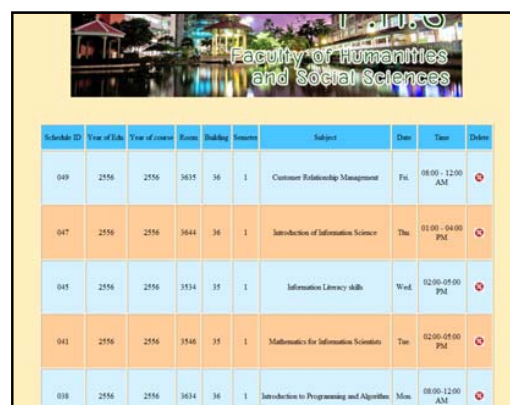
Fig. 5 Timetable Management Result System to Process Timetable from Users (Managed and Display Results)