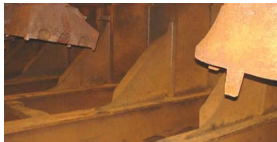
Fig. 1 Marine coating degradation showing rust in water ballast tanks [15]