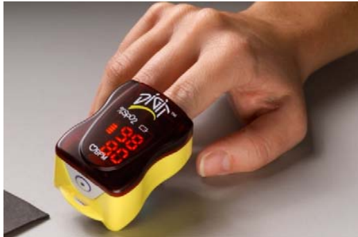
Fig. 6 Pediatric finger sensor [26]

If a finger sensor is too large, it may slip slightly off so that the light source partially covers the finger. This condition, called optical bypass, causes incorrect readings.