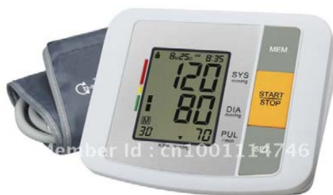
Fig. 1 A digital automatic upper-arm blood pressure monitor [7]

The upper-arm model has a cuff, which has to be placed on the upper arm and connected by a tube to the monitor.