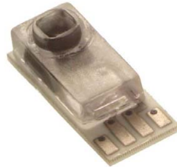
Fig. 5 Commercially available pressure sensor for blood pressure monitors [22]