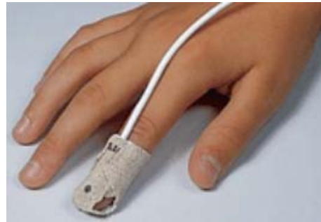
Fig. 9 Fingertip pulse oximeter [29]