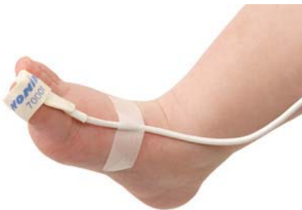
Fig. 7 Toe sensor for neonates [27]

Neonates tend to have movement artifact in their fingers, so choose a toe or foot sensor.