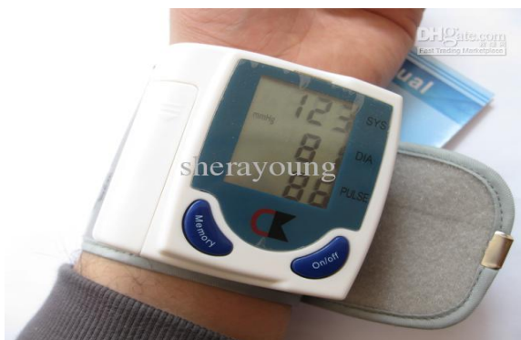
Fig. 2 A digital automatic wrist-cuff blood pressure monitor [8]

The wrist model has a smaller overall dimension and the whole unit has to be wrapped around the wrist. This is a much more space-critical design.