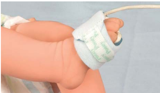
Fig. 8 Foot sensor for neonates [28]