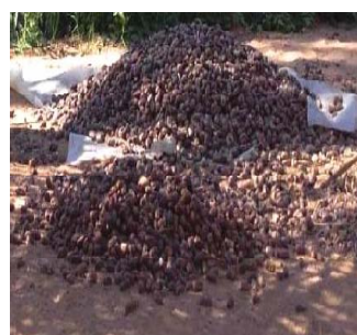
Fig. 1 Vegetable material

The substrate used for the production of alcohol is formed of the waste of dates on certain varieties of common dates.