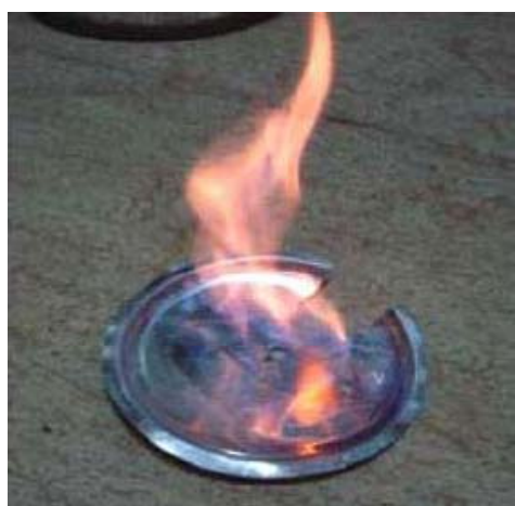
Fig. 5 Ethanol produced in the laboratory

The alcohol produced in the laboratory has the following characteristics: volatile, flammable, clear, with a pungent odor.