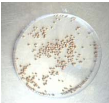
Fig. 2 Biological material

Saccharomyces cerevisiae is a species of yeast. It is perhaps the most useful yeast, having been instrumental to winemaking, baking, and brewing since ancient times.