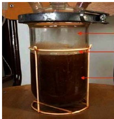
Fig. 3 Bioreactor of fermentation

At the end of fermentation, the wine is distilled to extract ethanol. The distillation temperature is about 78^\circ\text{C} [6].