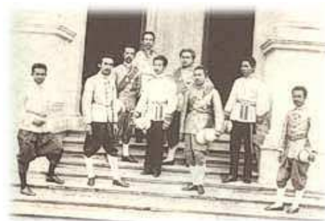
Fig. 3 Uniform in the reign of King Rama IV