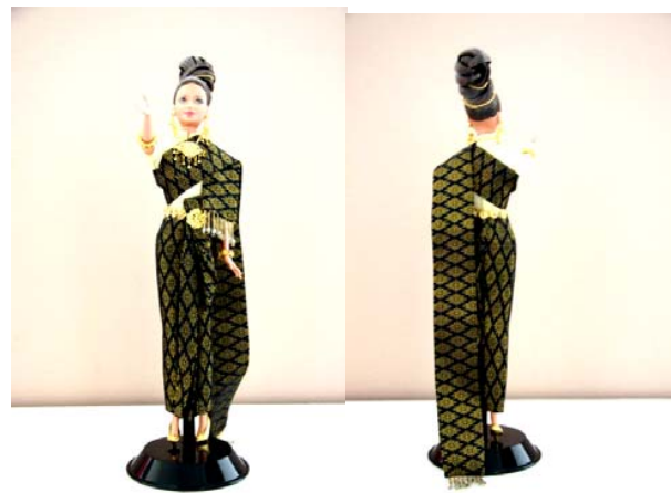
Fig. 16 Thai Siwalai dress (front and back).