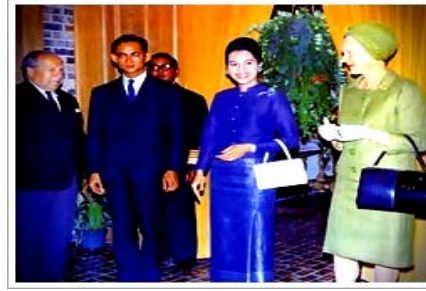
Fig. 6 The visiting of the King and Queen at Europe and America in 1960's

For Thai costume in the reign of King Rama IX (1946 to present), universal design is preferred due to influences from the western. However, people in local areas or countryside remain wearing Thai costume and local costume, i.e., wearing sarong, strip or loincloth. In 1977, Her Majesty Queen Sirikit was established a handicraft project to support products made by local woven fabric of villagers in various regions; therefore, this type of product was more recognized. However, it still preferred by people in high level society. Consequently, Her Majesty Queen Sirikit found the ways to create this product preferred extensively by general people; therefore, the royal initial was established to order skillful craftsmen of Fine Arts Department in many university to design Thai costume for Thai men by applying historical costume to be more contemporary and suit with current weather, environment, and convenience upon each occasion and place. Currently, the important evolution of Thai costume is formal Thai national costume, i.e., formal Thai national costume for women and Thai traditional costume for men, and it is accepted as Thai national costume [2].