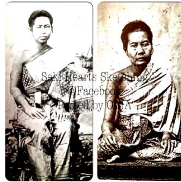
Fig. 1 Women costume in the reign of King Rama I-II

THAI traditional costumes has continually changed over 200 years of Rattanakosin era (1782 to present). During the Rattanakosin era, Thai costumes can be classified into 5 subcategories: Early Rattanakosin period, Mid-Rattanakosin period, Western Colonialism period, Cultural Mandates period and the modern period. Thai traditional clothing of each period varies by the environment, so it is impossible to judge which style is the best [1].