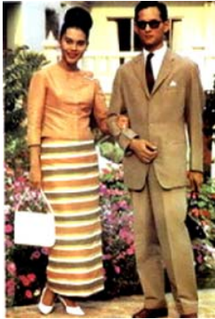
Fig. 7 Queen Sirikit in Thai Ruean Ton dress