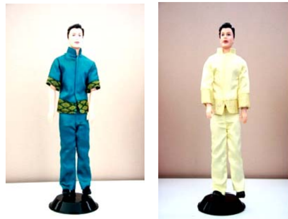
Fig. 24 Formal Thai national costume for men: short sleeve shirts and long sleeve shirts