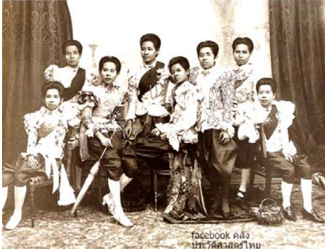
Fig. 4 The costumes Her Majesty the Queen and princess the reign of King Rama IV