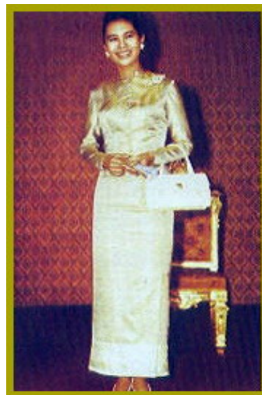
Fig. 11 Queen Sirikit in Thai Amarin dress