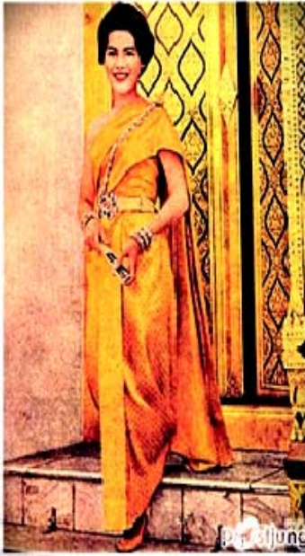
Fig. 17 Queen Sirikit in Thai Chakkri dress