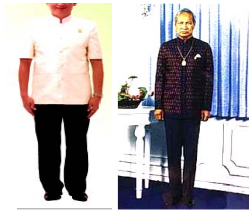
Fig. 23 Formal Thai national costume for men: short-sleeve shirt, long-sleeve shirt

Third design: Shirt with long-sleeves and waist wrapping called "Thai traditional costume" [6].