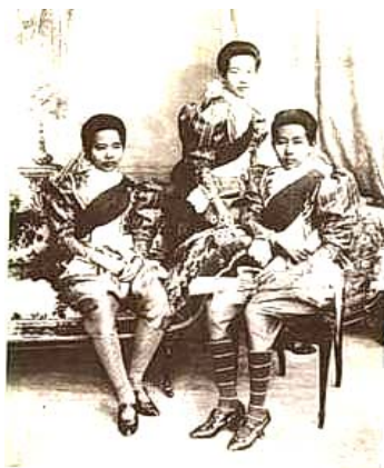
Fig. 5 The costumes Her Majesty the Queen and Princess the reign of King Rama IV

For Thai costume in the reign of King Rama IX (1946 to present), universal design is preferred due to influences from the western. However, people in local areas or countryside remain wearing Thai costume and local costume, i.e., wearing sarong, strip or loincloth. In 1977, Her Majesty Queen Sirikit was established a handicraft project to support products made by local woven fabric of villagers in various regions; therefore, this type of product was more recognized. However, it still preferred by people in high level society. Consequently, Her Majesty Queen Sirikit found the ways to create this product preferred extensively by general people; therefore, the royal initial was established to order skillful craftsmen of Fine Arts Department in many university to design Thai costume for Thai men by applying historical costume to be more contemporary and suit with current weather, environment, and convenience upon each occasion and place. Currently, the important evolution of Thai costume is formal Thai national costume, i.e., formal Thai national costume for women and Thai traditional costume for men, and it is accepted as Thai national costume [2].