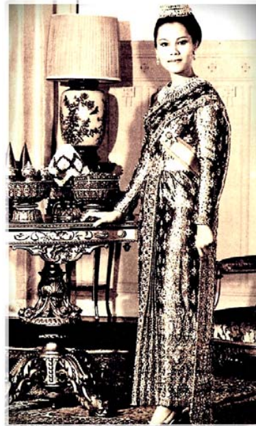
Fig. 15 Queen Sirikit in Thai Siwalai dress