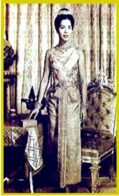
Fig. 21 Queen Sirikit in Thai Dusit dress