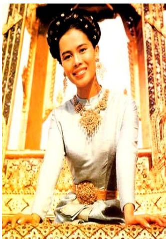
Fig. 13 Queen Sirikit in Thai Boromphiman dress