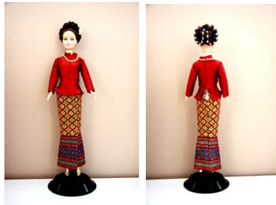
Fig. 10 Thai Chit Lada dress (front and back).