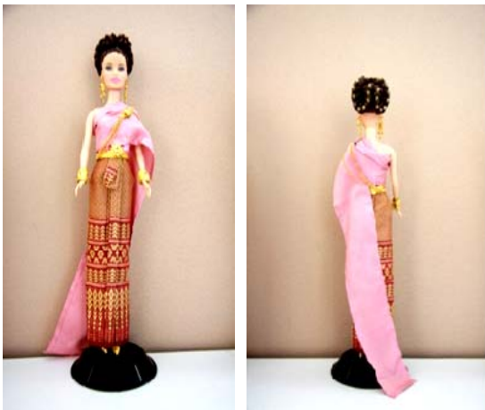
Fig. 18 Thai Chakkri dress (front and back)