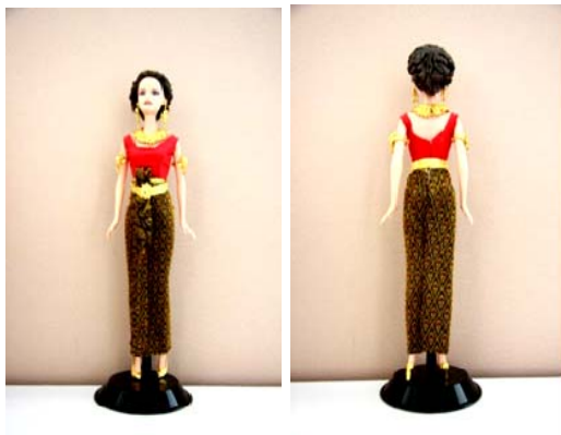
Fig. 22 Thai Dusit dress (front and back)

Formal Thai national costumes for women have been existed since the reign of King Rama IX and they were preferred to be worn in various well-known ceremonies as shown in above history. For Thai traditional costume for men, suits were previously preferred until 1977. In 1977, Her Majesty Queen Sirikit established handicraft project to support products made by local woven fabric of villagers in various regions therefore this type of product was more recognized. However, it was still preferred by people in high class society. [4] Consequently, Her Majesty Queen Sirikit found the ways to make this type of product preferred extensively by general people therefore the royal initial was established to order skillful craftsmen of Fine Arts Department to design Thai costume for Thai men by applying historical costume to be more contemporary and suit with current weather, environment, and convenience upon each occasion and place. As a result, the obtained design was