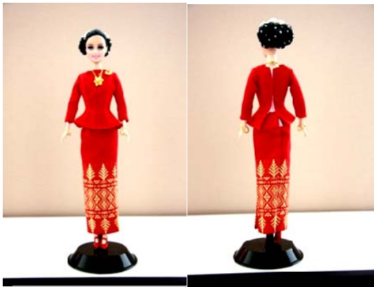
Fig. 8 Thai Ruean Ton dress (front and back)