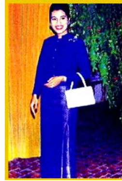
Fig. 9 Queen Sirikit in Thai Chit Lada dress