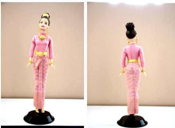
Fig. 14 Thai Boromphiman dress (front and back)