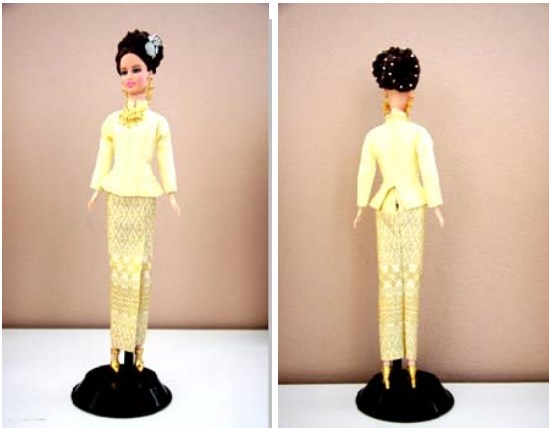
Fig.12 Thai Amarin dress (front and back).