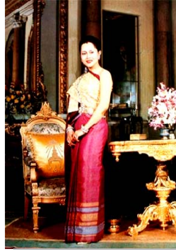
Fig. 19 Queen Sirikit in Thai Chakkraphat dress