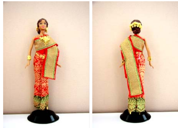
Fig. 20 Thai Chakkraphat dress (front and back)