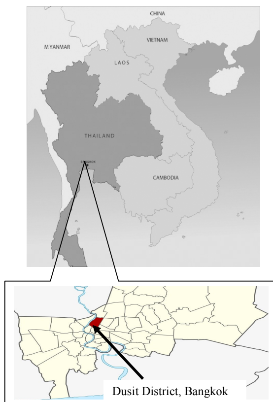
Fig. 1 Dusit District, Bangkok, Thailand [3]

Urban air pollution resulting from traffic is a major problem in Bangkok, Thailand.