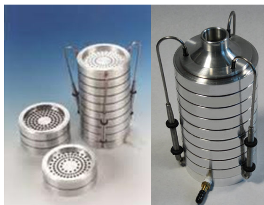
Fig. 3 Eight Stage non-Aviable Cascade Impactor

The filters were kept in dessicators for 24 hrs. (to remove any moisture content before mounting them on the air sampler). After sampling, filter papers were immediately transferred to dessicators to again de-moisturize them in the same manner.