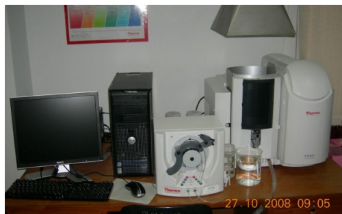
Fig. 4 Atomic Absorption Spectrophotometer Instrument (THERMO series)