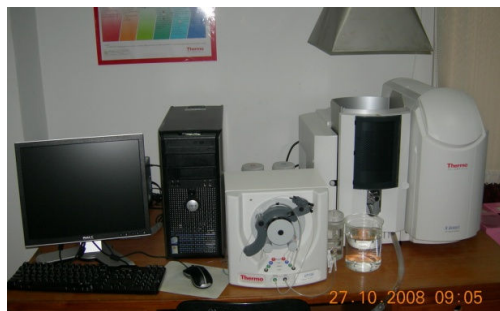
Fig. 4 Atomic Absorption Spectrophotometer Instrument (THERMO series)