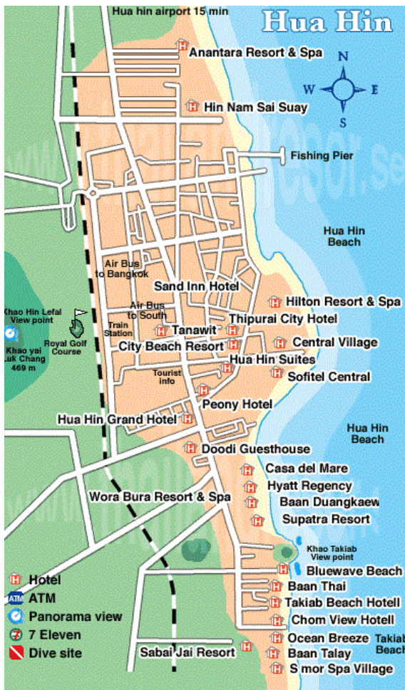
Fig. 1 Hua Hin community and the local nearby areas

Hua Hin, as shown in Fig. 1, the area map of Hua Hin, Prachaup Khiri Khan Province, Thailand is considered an area that has been highly development in the various fields such as tourism and economic of the area's rapid growth.