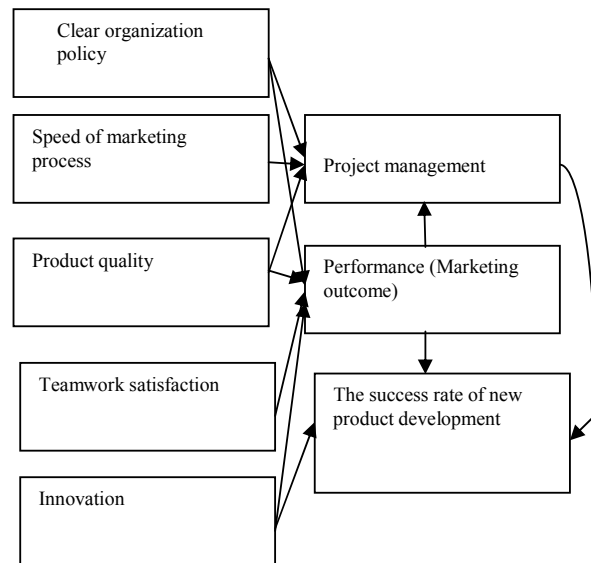
Fig. 1 Conceptual Framework

percentage, mean, standard deviation as well as t-test. The conceptual framework is shown in Fig. 1.