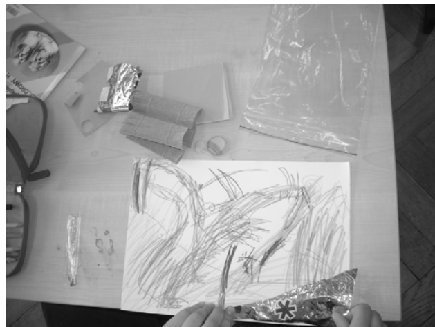
Fig. 4 Mike’s artistic interpretation of “Three Little Pigs”

After the analysis of available documentation, a general profile of Mike was created. Actually, not much is known for a conscientious teacher to prepare a decent action plan and instructional strategy of how to work with Mike. Of course, a careful examination of the child’s documents is indispensable and should constitute the first step. However, for the sake of knowledge extension and personal experience, it should be followed by teacher observation which can be aided by a checklist. Every child is an individual. Similarly, every autistic child is different. Each may display communication, social and behavioural symptoms that are unique but still fit into the overall diagnosis of ASD. No two children diagnosed with autism manifest it in exactly the same way [9]. Thus, we may obtain varied results using the same checklist with many subjects.