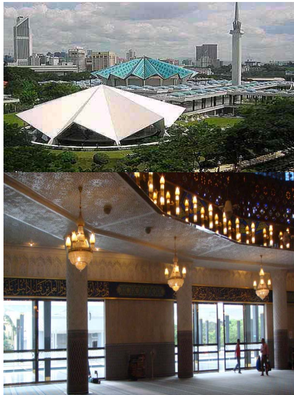
Fig. 2 Exterior (Top) and Interior (Bottom) of Masjid Negara

Sarawak State Mosque and many others are the examples of Postmodern Revivalism Architecture in Malaysia. Tajuddin [44] explained the vocabulary of this style as the use of an eclectic array of: a) Iranian or Turkish domes, b) Egyptian or Turkish Minarets, c) Persian Iwan gateways, d) lavish courtyards surrounded by the Sahn, e) an Arabian hypostyle planning composition, f) and pointed or semicircular arches bathed in sumptuous classical 'Islamic' decorations. Out of all postmodern mosques of Malaysia, this study focused on Masjid Putra in Putrajaya (Fig. 3) and Masjid Wilayah in Kuala Lumpur (Fig.4) as the representatives of this style.