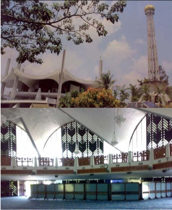
Fig. 1 Exterior (Top) and Interior (Bottom) of Masjid Negeri Sembilan