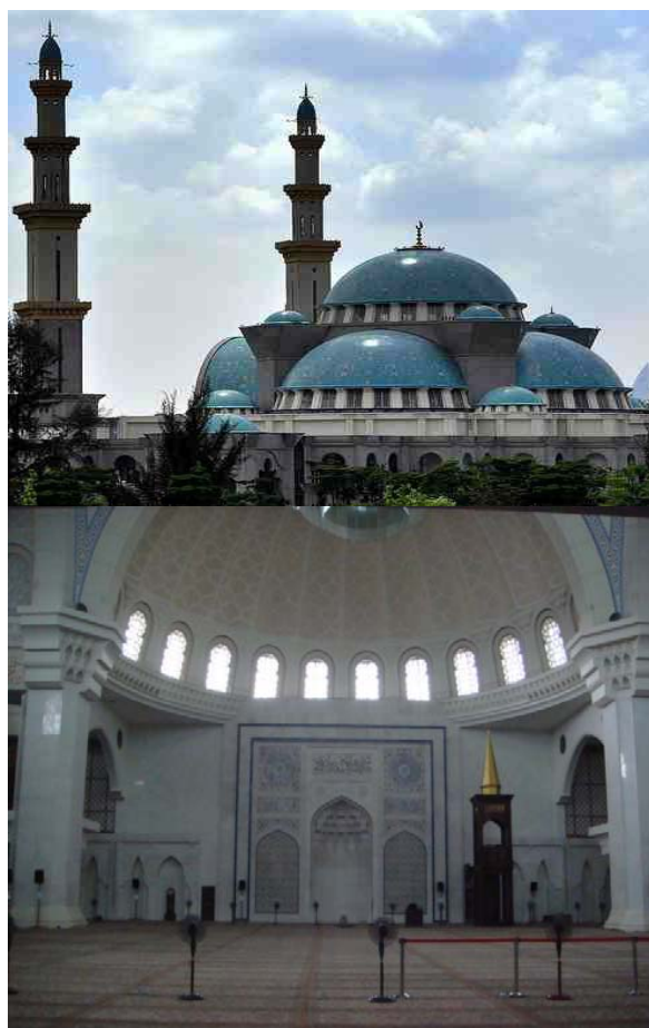
Fig. 4 Exterior (Top) and Interior (Bottom) of Masjid Wilayah

subjects of the conducted semi-structured interviews were as the following: Engagement, Familiarity, Emotional attachment, Functional attachment, Socio-cultural attachment. In terms of data analysis, they articulated the collected data into three categories namely, physical feature, activities, and meanings, then dividing these three categories into codes and subcategories. Therefore, conducting qualitative content data analysis, Najafi and Shariff [48] sought for development of the aforementioned three headlines and their subcategories into key indicators of the study reported in this paper.