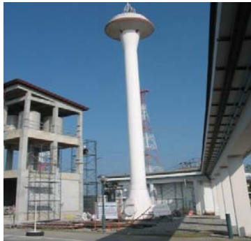
Fig. 2 The design of the Office of Accelerated Rural Development