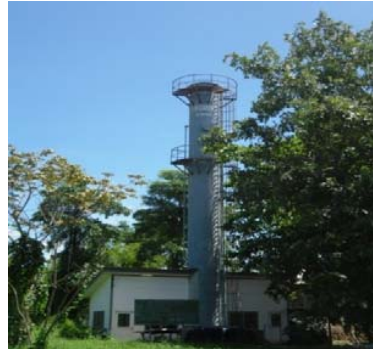
Fig. 5 The design of the Department of Local Administration cooperated with the Metropolitan Waterworks Authority