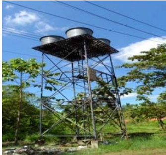
Fig. 1 The design of the Department of Public Works

in clear water storage tank and disinfected by use of Chlorine solution. Purified water will be pumped up, using volute pump, from the clear water storage tank to high tower tank. Water ready for consumption will be distributed through pipe line network to households. Designs of community's water tanks vary by standard of different water management organizations (Figs. 1-5)