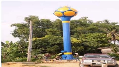
Fig. 3 The design of the Department of Mineral Resources