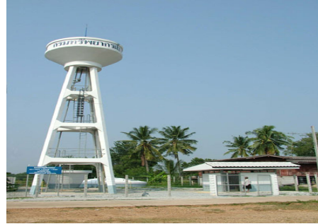
Fig. 4 The design of the Department of Water Resources