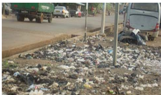
Fig. 3 Indiscriminate dumping in Tamale Metropolis

Despite the apparent weak institutional capacity to manage environmental sanitation in Tamale, the interviews with the city residents revealed that the poor attitudes of some city residents appear to be the major cause of poor environmental sanitation. Majority of city residents interviewed admitted that they have engaged in acts of indiscriminate disposal of wastes. As illustrated in Fig. 3, indiscriminate disposal of solid waste mainly plastic and polythene materials has become a communal practice in the metropolis causing urban blight. Although some city residents attributed the indiscriminate disposal of waste to lack of refuse collection and management system, the study findings suggest that majority of them littered the streets on purpose. One city resident commented that: "... the Zoomlion workers (private waste management institution) have been paid to clean the city, if we don't litter the streets, they won't have any work to do ...". This quote emphasizes the apathy some of the residents in the metropolis have developed towards environmental sanitation, a situation which has resulted in heaps of wastes on the road sides.