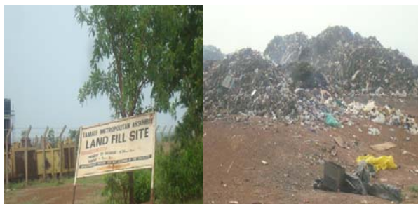
Fig. 2 The state of the Tamale landfill site

constraints. According to the WMD, not less than GH¢100,000 (US$ 66,600) is needed weekly to maintain the land fill site, a financial commitment which the city authorities' claim cannot be met due to inadequate resources. Ideally, the land fill site is supposed to be treated weekly to avoid or minimize any hazards such as outbreak of diseases but the study findings indicate that since 2010 the land fill has not received any treatment. As a result, residents living close to the facilities lamented the awful conditions of stinking heaps of waste from the land fill site.