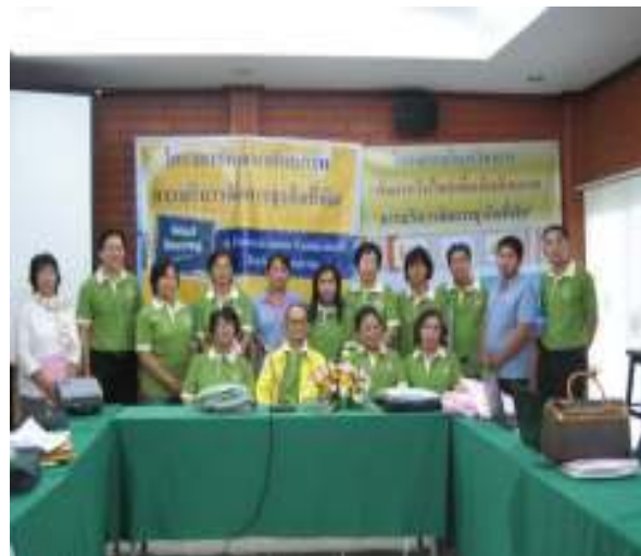
Fig. 7 Ruk Bang Khonthi group

We have suggestions in two main aspects which are a policy and a suggestion for the entrepreneur of the residential in Samut Songkhram. A suggestion regarding the policy for Bang Khonthi district including a whole province of Samut Songkhram is that there must be a sponsor for an ecotourism which emphasizes on arts, culture, and the color of way of life. Also, the nature must be preserved by raising more awareness of tourists towards its importance to all lives on earth. The local people should be encouraged to form a network such as Ruk Bang Khonthi group which lets them share opinion and help one another. Eventually, this will lead to a learning process and an experience accumulation. In order to develop the tourism in this particular area, the policy should not be done hurriedly or comparing with others. The main goal is to let everybody involve and thoroughly have them experience the most out of this development. Hence, it can be said that living in accordance with the philosophy of sustainable economy is one approach leading to a real strong community as people are always reminded of a cautious life.