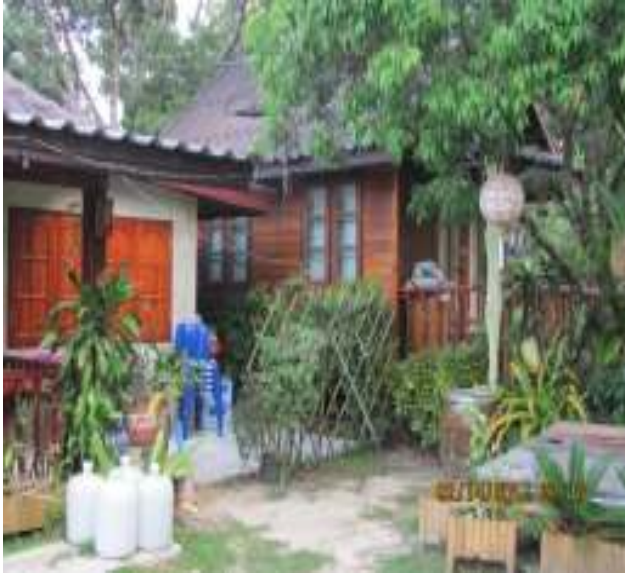
Fig. 5 Hospitality Business in Bang Khonthi