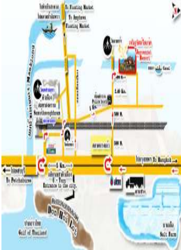
Fig. 1 Map of Samut Songkram