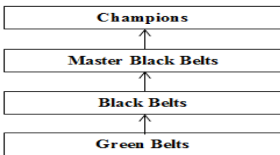
Fig. 2 The stages of Six Sigma [18]