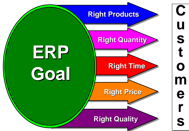
Fig. 2 The goal of enterprise resource planning [3]