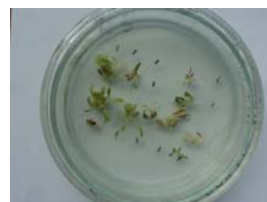
Fig. 1 Multiple shoot regeneration from a seed explants of Taraxacum kok-saghyz in the MS medium containing 1.0 mg/L BA

treatment containing 1.0 mg/L BA (48%). Shoot regeneration percentages in 3.0 mg/L BA and 3.0 mg/L 2,4-D were 16% and 12% respectively. Lee et al [11] reported that MS media without phytohormones is better for shoot regeneration from seed explants of Taraxacum platycarpum , which it not corresponds with our results of seed culture of Taraxacum kok-saghyz . We found that low level (0.5mg/L) of these hormones (BA and 2,4-D) is not suitable for shoot regeneration from seeds of kok-saghyz.