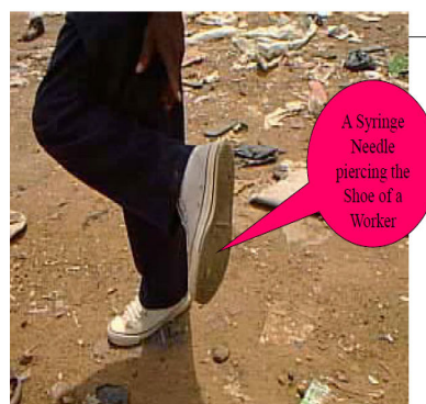
Fig. 3 Risk at a Dump Site in Kwara State Nigeria [20]