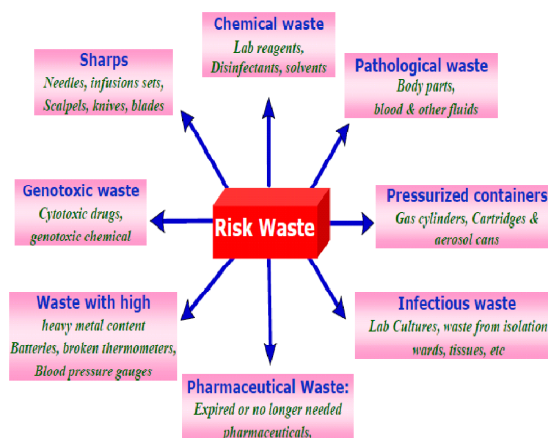
Fig. 2 Categories of hazardous medical waste [15]

According to [16], [17], and [15] health-care waste is classified as Sharp waste (e.g., hypodermic needles, scalpels etc.), Chemical waste (e.g., reagents, solvent etc.), Pathological waste (e.g., human tissues, body parts, fetus, etc.), Infectious waste (e.g., blood and body fluids etc.), Pressurized containers (e.g., gas cylinders, aerosol etc.), Pharmaceutical waste (e.g. out-dated medications, etc.), Genotoxic waste (e.g., cytotoxic drugs and genotoxic chemical) and Waste with high heavy metal content (e.g., batteries, thermometers etc.) (See Fig. 2):