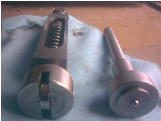
Fig. 3 Ball burnishing tool